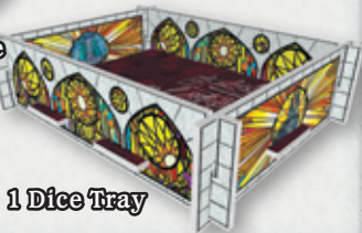
1 Dice Tray