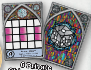
6 Private Objective Cards