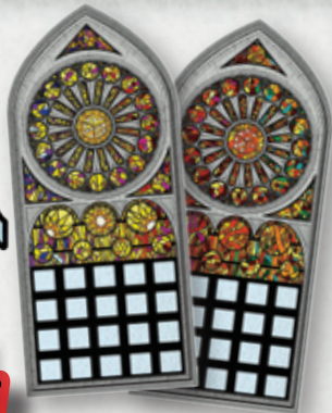
2 Window Frame Player Boards