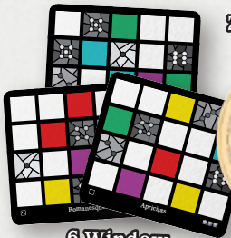
6 Window Pattern Cards